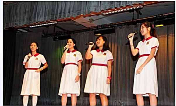
Representatives of Christian Alliance S C Chan Memorial College