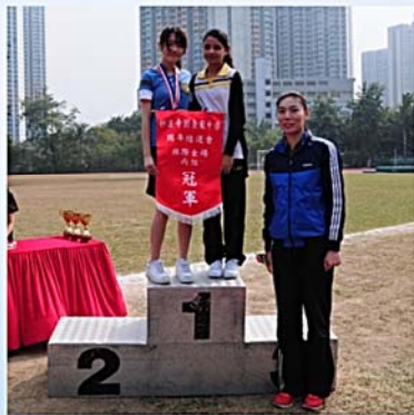
C Grade Inter-Class Overall Champion