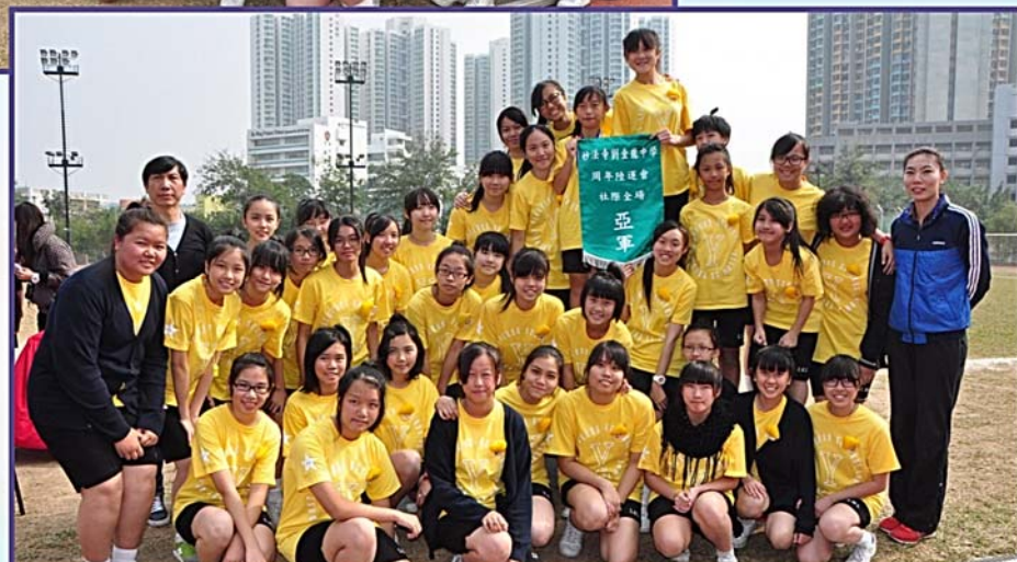
Inter-house Overall 1st Runner-up