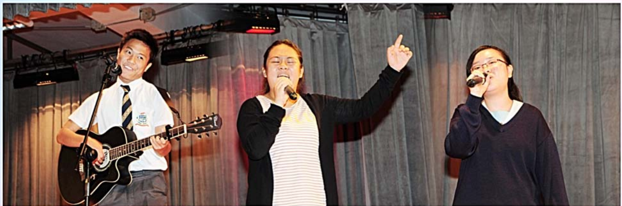
Representatives of St. Joseph's Anglo - Chinese School