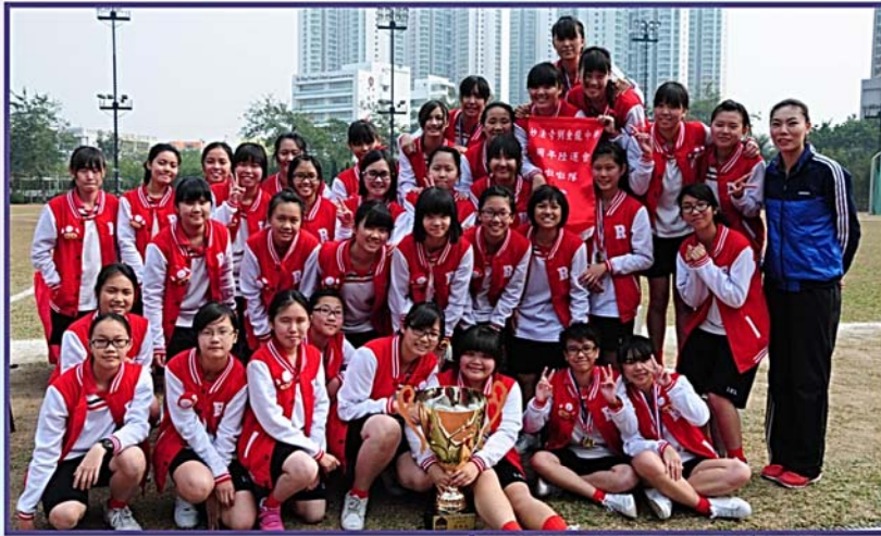
Cheering Team Competition Champion