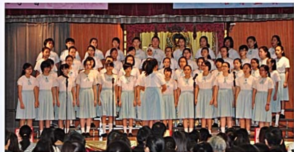
Students' Performance: Choral Speaking