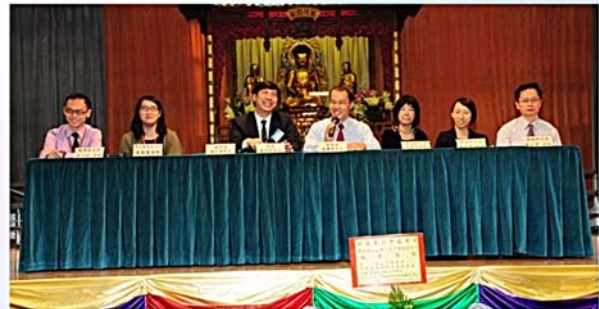
Q & A session