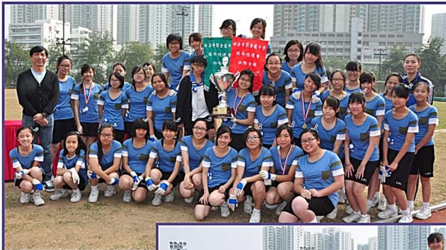
Inter-house Overall Champion