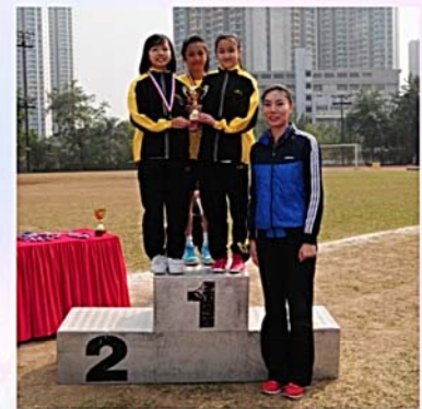
D Grade Individual Champion