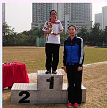
B Grade Individual Champion