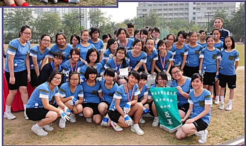
Cheering Team Competition 1st Runner-up