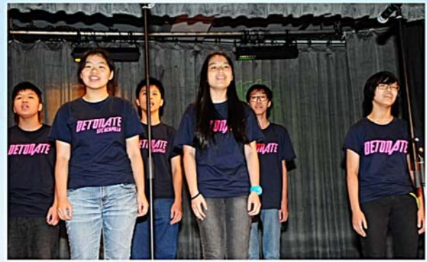
Representatives of Shung Tak Catholic English College