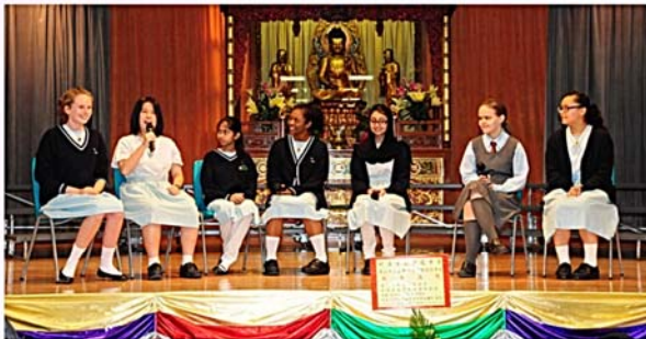
Sharing by Exchange Students and non-Chinese Speaking Students: "Learning Profile in our School"