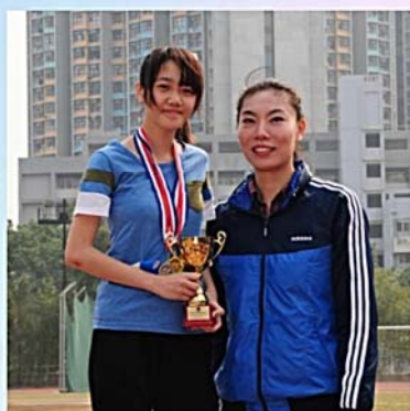
C Grade Individual Champion