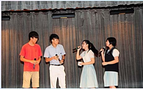
Representatives of Yan Oi Tong Tin Ka Ping Secondary School