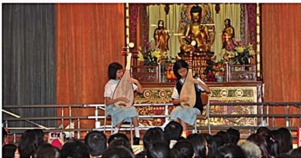
Students' Performance: Pipa Ensemble