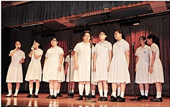
Representatives of South Tuen Mun Government Secondary School