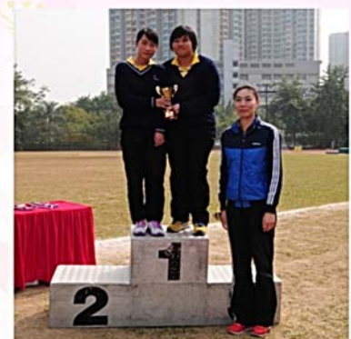
A Grade Individual Champion