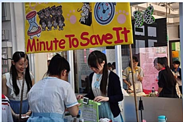
Stall Games (Theme: Go Global)