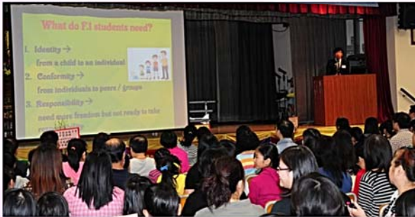
Principal's Talk: "What should Secondary 1 Students Learn?"