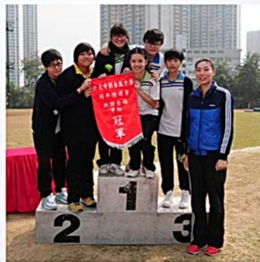
A Grade Inter-Class Overall Champion