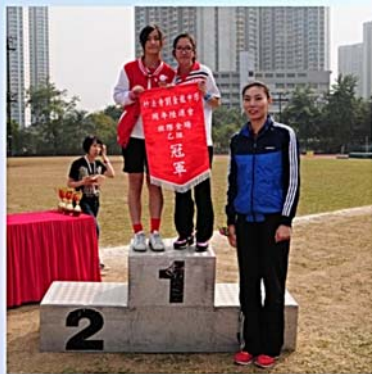
B Grade Inter-Class Overall Champion