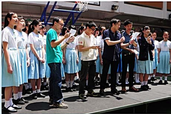
Teacher - student Singing Performance

Foreign Culture Club and Career and Studies Committee