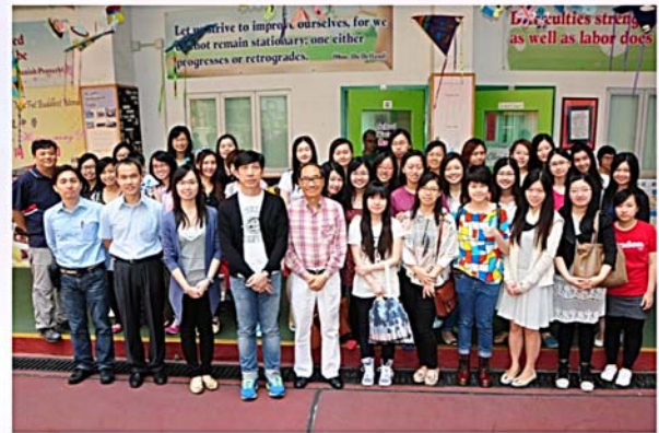
School Supervisor, Principal, Teachers and Alumni