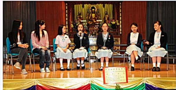
Sharing by Outstanding Alumni: "Study Methods and Learning Situation"