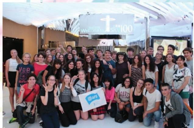
Activities with exchange students from other countries