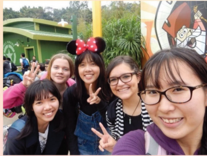
Funny trip to Disneyland Hong Kong